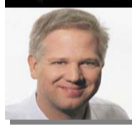
Best of Beck Sat 5p-8p