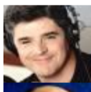
Sean Hannity M-F 6-9 pm